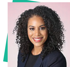
Arameh Anvarizadeh, OTD, OTR/L, FAOTA

As we journey towards Vision 2030, it's time to reimagine the role of occupational therapy within a rapidly evolving global landscape. This inaugural presidential address explores the power that often thrives in the shadows of underestimation, and how embracing communal diversity strengthens our collective identity. Through these themes, we'll delve into the transformative potential of our field, harnessing the synergy of science, systems changes, and inclusion to forge a visionary future for occupational therapy.